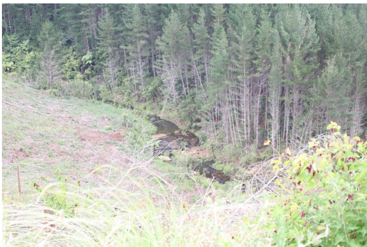
The Mahurangi River Crossing, another major area of focus for MCTT