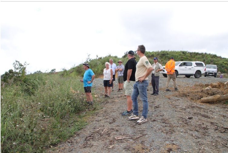
The team surveying the route down to the Mahurangi River crossing at the north end of the API land